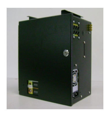
Figure 7: G3 Table Controller

Installed under each table where the G3 system is running, the device controls all hardware and software components (PBM, TD, DI) at the table level. This computer communicates with the G3 Game Server through an Ethernet (TCP-IP) connection.