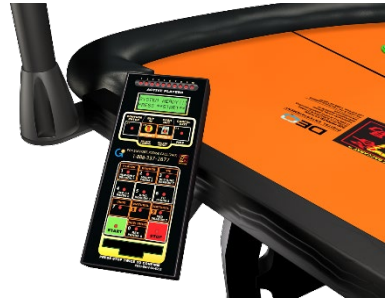
Figure 4: Installed Dealer Interface

The dealer interface is installed on a metal support fixed to the table as shown in Figure 4.