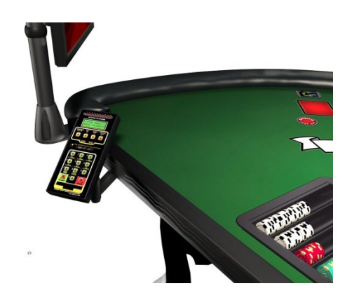
Figure 4: Installed Dealer Interface

The dealer interface is installed on a metal support fixed to the table as shown in Figure 4.