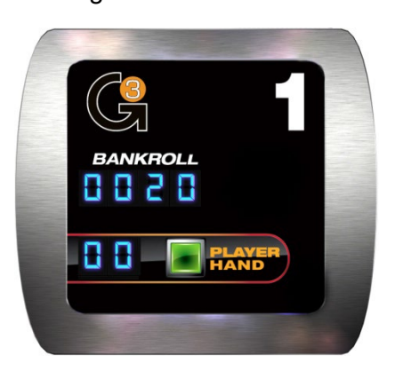
Figure 2: The Personal Bet Manager

Located in front of each betting spots, the personal bet managers are the interfaces used by the players to place their side wager. The player buys credits from the dealer and once they are available in his credit bank, he can place a bet using the dealer hand button.