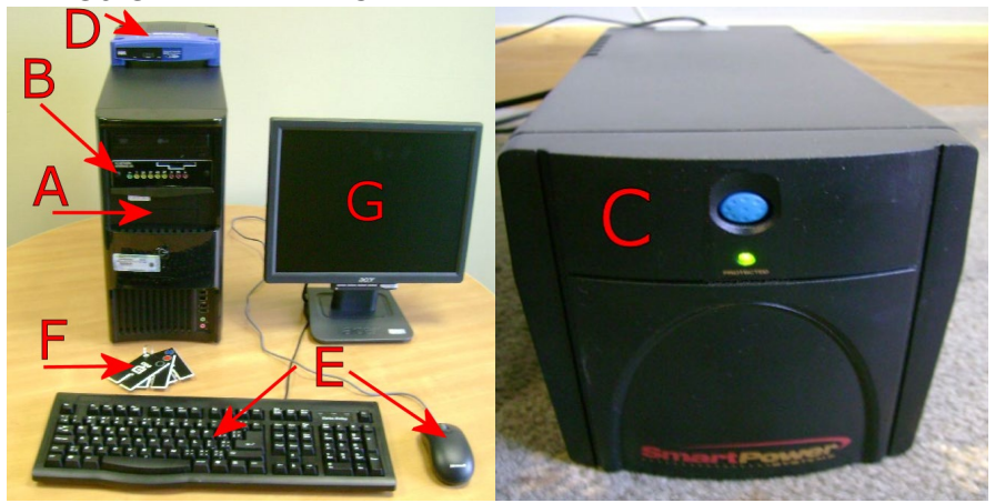
Figure 6: G3 Game Server