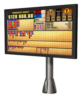
Figure 5: The LCD Screen