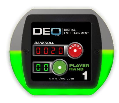
Figure 2: The Personal Bet Manager

Located in front of each betting spots, the personal bet managers are the interfaces used by the players to place their side wager. The player buys credits from the dealer and once they are available in his credit bank, he can place a bet using the player hand button.