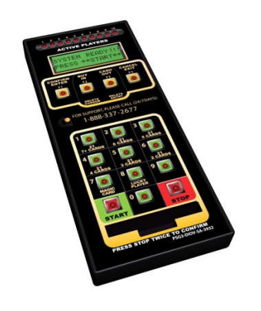
Figure 3: The Dealer Interface

This device is used by the dealer to operate the system. The house dealer can buy and sell credits to players and manage the course of the game. When a prize is awarded to a player, a supervisor or a manager can login on the system using a key on the dealer interface and proceed with the payment.