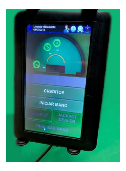
Appendix 3: Dealer Terminal

This device is used by the dealer to operate the system. The house dealer can buy and sell credits to players and manage the course of the game. When a prize is awarded to a player, a supervisor or a manager can login on the system using a key on the dealer interface and proceed with the payment.