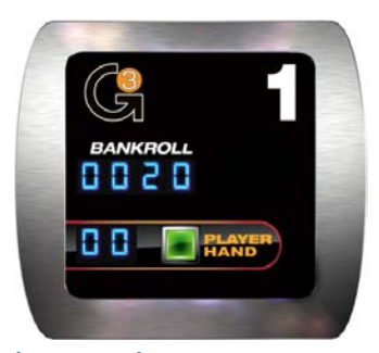
Figure 2: The Personal Bet Manager

Located in front of each betting spots, the personal bet managers are the interfaces used by the players to place their side wager. The player buys credits from the dealer and once they are available in his credit bank, he can place a bet using the dealer hand button.