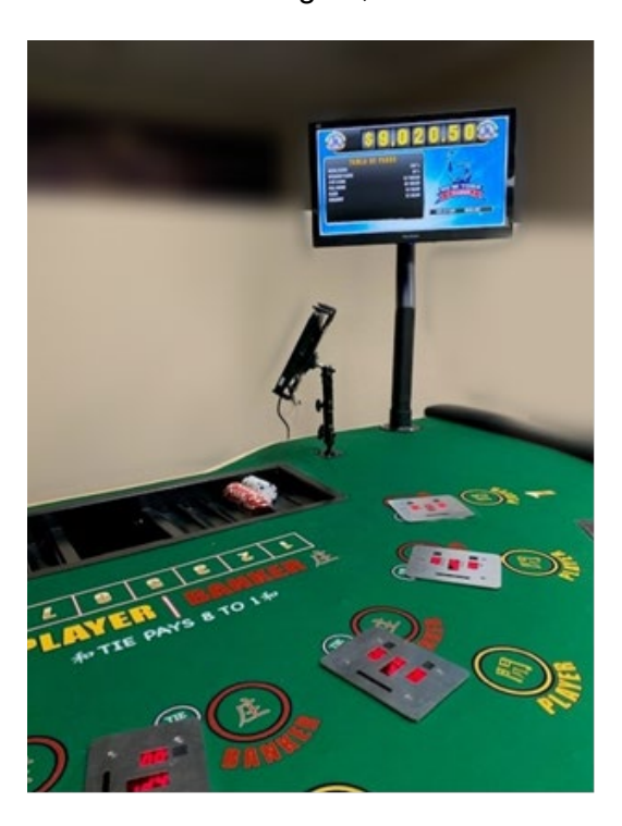
Appendix 2: Player Betting Spots

The current section presents the important components of the Empire Mikohn Progressive Jackpot Tracking Systems. The system is mainly composed of these visible components: The Personal Bet Managers, A Dealer Interface and a double-sided LCD screen.