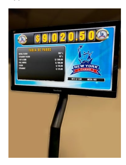
Appendix 4: The LCD Screen

This device is used by the dealer to operate the system. The house dealer can buy and sell credits to players and manage the course of the game. When a prize is awarded to a player, a supervisor or a manager can login on the system using a key on the dealer interface and proceed with the payment.