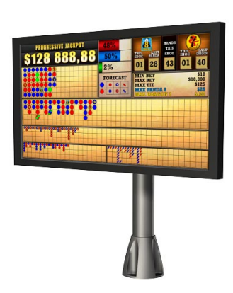
Figure 5: The LCD Screen

Located on one side of the table, the screen displays a graphical animation showing all the important information related to the game, the payout schedule, the various transactions being performed and the live jackpot value.