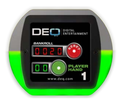
Figure 2: The Personal Bet Manager

Located in front of each betting spots, the personal bet managers are the interfaces used by the players to place their side wager. The player buys credits from the dealer and once they are available in his credit bank, he can place a bet using the player hand button.