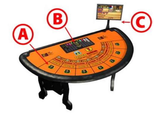
Figure 1: The G3 Progressive Jackpot Tracking System

The current section presents the important components of the G3 Progressive Jackpot Tracking Systems. The system is mainly composed of these visible components: The Personal Bet Managers, A Dealer Interface and a double-sided LCD screen.