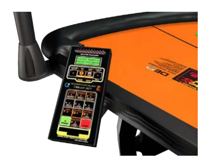
Figure 4: Installed Dealer Interface

The dealer interface is installed on a metal support fixed to the table as shown in Figure 4.