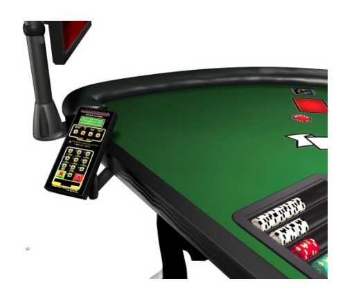
Figure 4: Installed Dealer Interface

The dealer interface is installed on a metal support fixed to the table as shown in Figure 4.