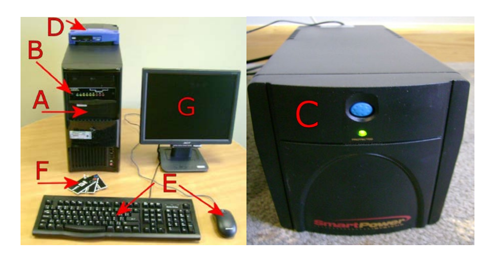
Figure 6: G3 Game Server