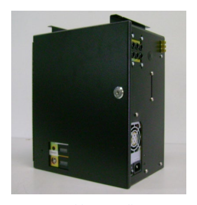
Figure 7: G3 Table Controller

Installed under each table where the G3 system is running, the device controls all hardware and software components (PBM, TD, DI) at the table level. This computer communicates with the G3 Game Server through an Ethernet (TCP-IP) connection.