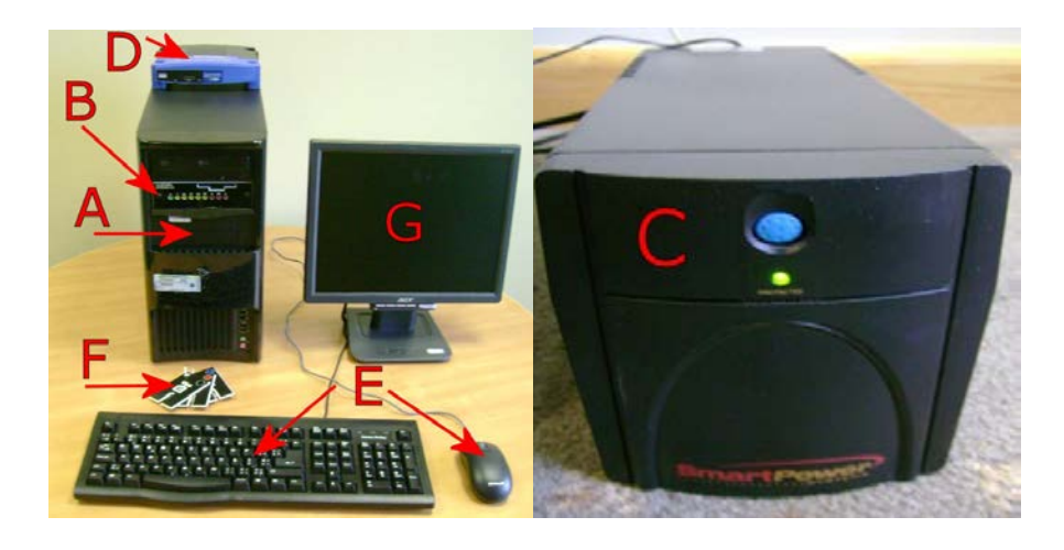
Figure 6: G3 Game Server