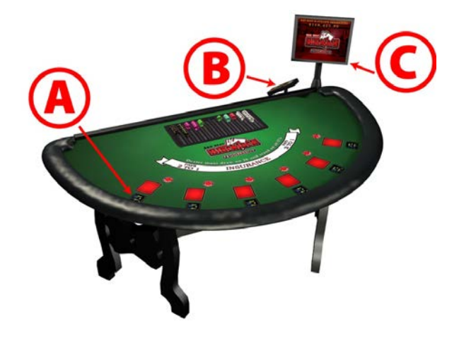
Figure 1: The G3 Progressive Jackpot Tracking System

The current section presents the important components of the G3 Progressive Jackpot Tracking Systems. The system is mainly composed of these visible components: The Personal Bet Managers, A Dealer Interface and a double-sided LCD screen.