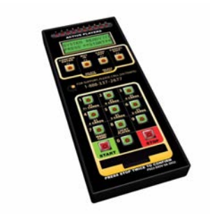
Figure 3: The Dealer Interface

This device is used by the dealer to operate the system. The house dealer can buy and sell credits to players and manage the course of the game. When a prize is awarded to a player, a supervisor or a manager can login on the system using a key on the dealer interface and proceed with the payment.