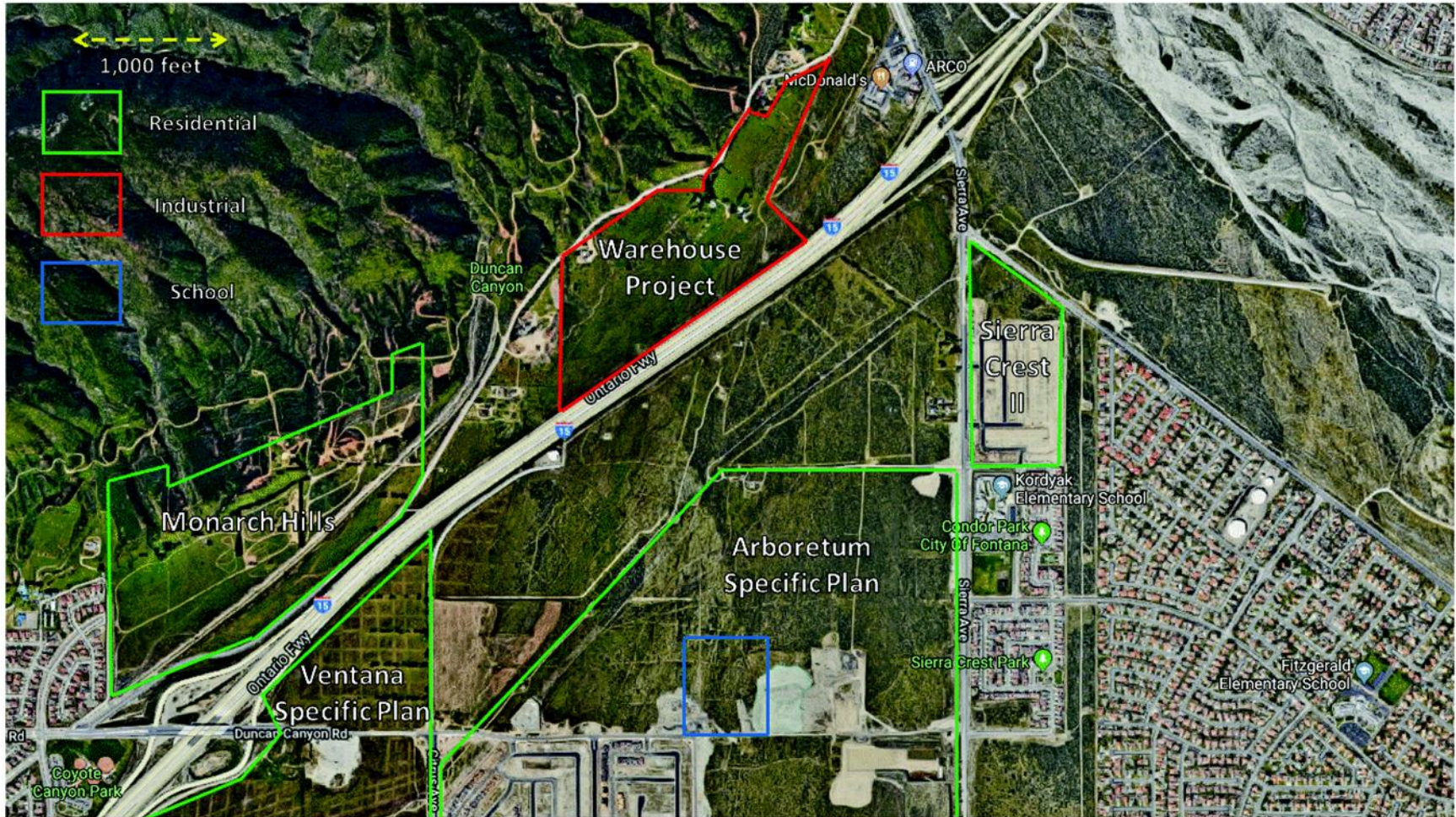
Figure 1: Approved Developments Near Project Site