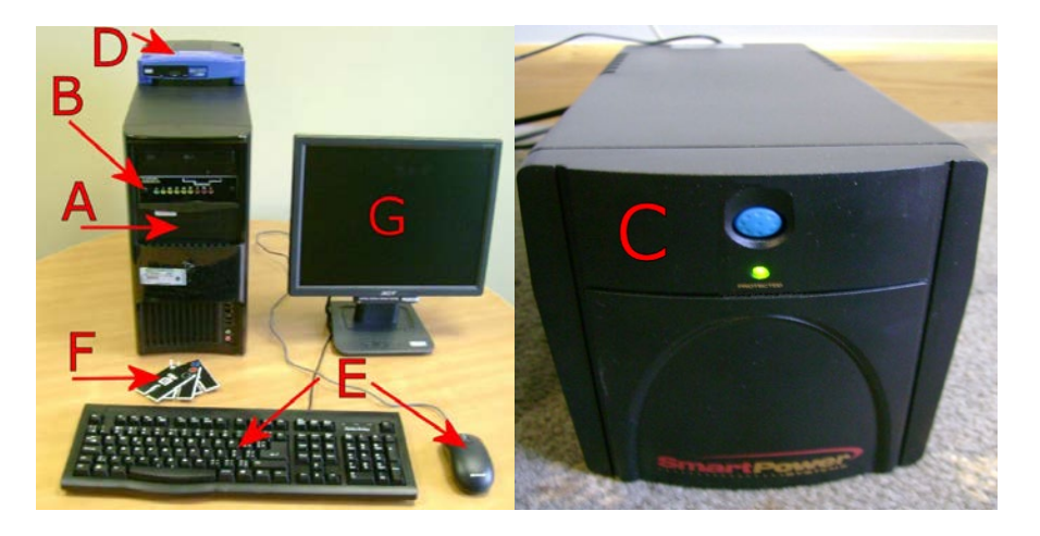
Figure 6: G3 Game Server