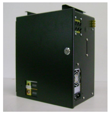
Figure 7: G3 Table Controller

Installed under each table where the G3 system is running, the device controls all hardware and software components (PBM, TD, DI) at the table level. This computer communicates with the G3 Game Server through an Ethernet (TCP-IP) connection.