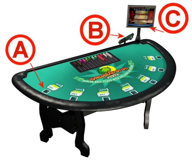
Figure 1: The G3 Progressive Jackpot Tracking System

The current section presents the important components of the G3 Progressive Jackpot Tracking Systems. The system is mainly composed of these visible components: The Personal Bet Managers, A Dealer Interface and a double-sided LCD screen.