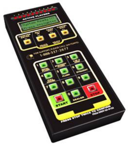
Figure 3: The Dealer Interface

This device is used by the dealer to operate the system. The house dealer can buy and sell credits to players and manage the course of the game. When a prize is awarded to a player, a supervisor or a manager can login on the system using a key on the dealer interface and proceed with the payment.