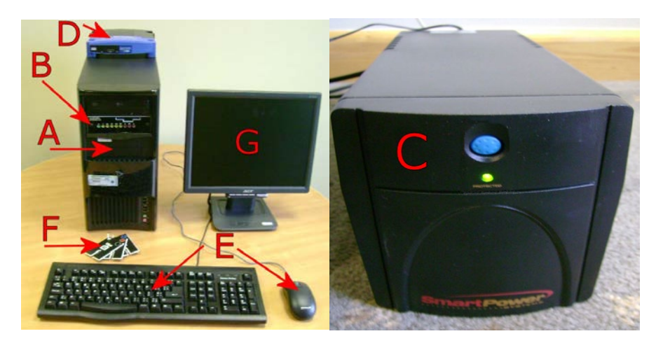
Figure 6: G3 Game Server