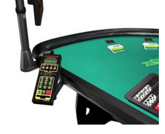
Figure 4: Installed Dealer Interface