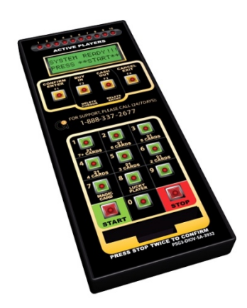
Figure 3: The Dealer Interface

This device is used by the dealer to operate the system. The house dealer can buy and sell credits to players and manage the course of the game. When a prize is awarded to a player, a supervisor or a manager can login on the system using a key on the dealer interface and proceed with the payment.