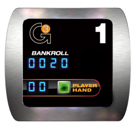
Figure 2: The Personal Bet Manager

Located in front of each betting spots, the personal bet managers are the interfaces used by the players to place their side wager. The player buys credits from the dealer and once they are available in his credit bank, he can place a bet using the player hand or dealer hand buttons.