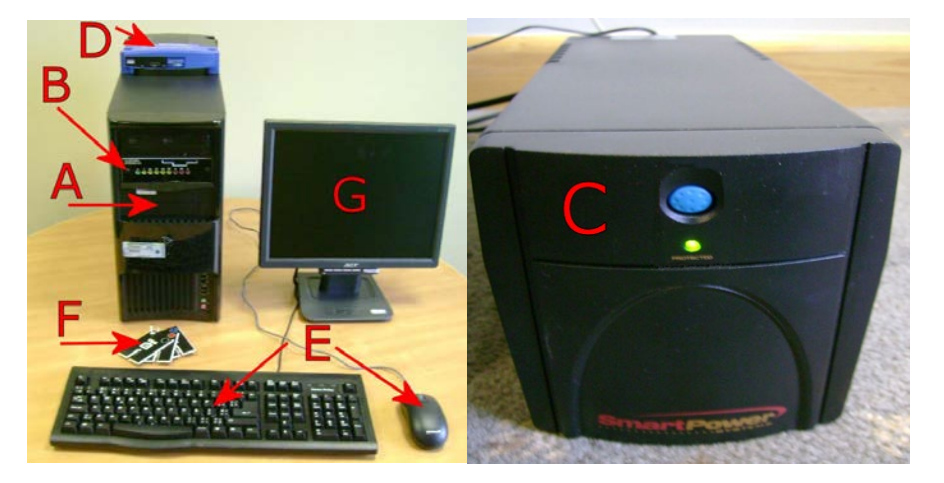
Figure 6: G3 Game Server