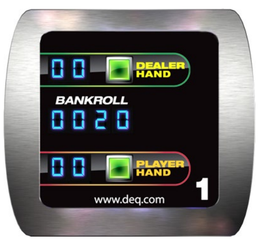
Figure 2: The Personal Bet Manager

Located in front of each betting spots, the personal bet managers are the interfaces used by the players to place their side wager. The player buys credits from the dealer and once they are available in his credit bank, he can place a bet using the player hand or dealer hand buttons.