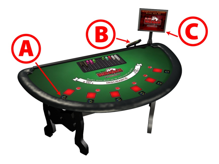
Figure 1: The G3 Progressive Jackpot Tracking System

The current section presents the important components of the G3 Progressive Jackpot Tracking Systems. The system is mainly composed of these visible components: The Personal Bet Managers, A Dealer Interface and a double-sided LCD screen.