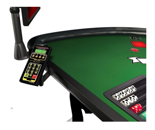
Figure 4: Installed Dealer Interface

The dealer interface is installed on a metal support fixed to the table as shown in Figure 4.