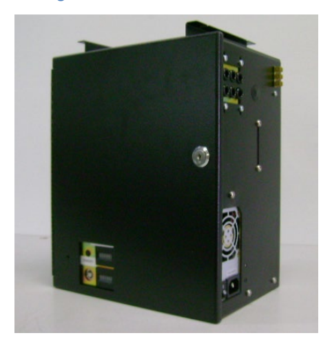
Figure 7: G3 Table Controller

Installed under each table where the G3 system is running, the device controls all hardware and software components (PBM, TD, DI) at the table level. This computer communicates with the G3 Game Server through an Ethernet (TCP-IP) connection.