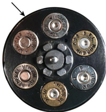
Appearance of cylinder as recovered